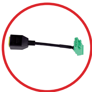
CCA Euroblock to category cable adapter