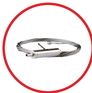
Seismic Cable Adapter Cable adapter for PoE amp plenum boxes