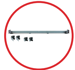
TB-1 Tile bridge for TCM plenum boxes