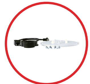
TCM-X-DK Plenum attachment for drywall ceilings