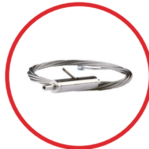
Seismic Cable Adapter Cable adapter for TCM plenum boxes