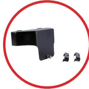
BPAK Backpack adapter kit