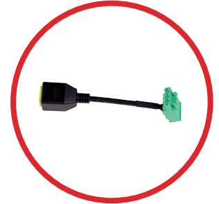
CCA Euroblock to category cable adapter